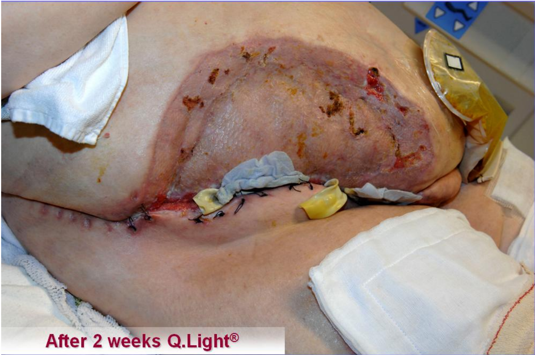
After 2 weeks Q.Light®